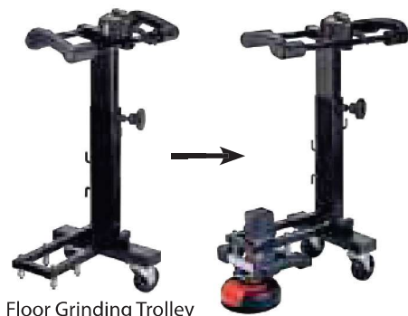
Floor Grinding Trolley